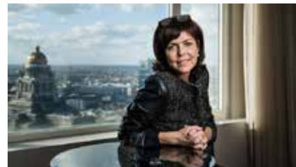
ECES President of Strategic and Advisory Committee, Joëlle Milquet

In September 2020 ECES welcomed in its team Joëlle Milquet, a former Belgium Deputy Prime Minister, former Minister of Defense , and Special Adviser to President of the European Commission, Jean-Claude Juncker for the compensation of victims of crime.