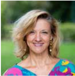
ECES President, Monica Frassoni

experience in European and foreign affairs, proactively contributing in the establishment and successes of ECES also via her regular activity as speaker and lecturer in important academic fora and large public events, focusing on democracy and participation of civil society (notably women and youth, in decision-making at all levels) and also on sustainable energy and energy savings, green transformation of the global economy and society to fight exclusion and climate change.