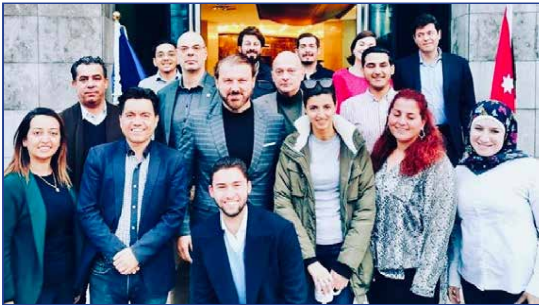
ECES Team in front of ECES office in Jordan (EU-JDID Project)

These guidelines cover everything from audience understanding to social media analytics, going through taking better pictures, writing better words, banner and logo design as well as copyrights and search engine optimisation.