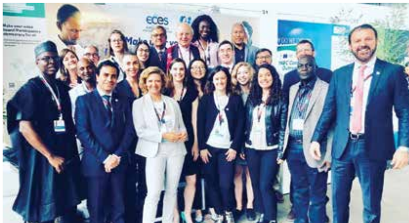
ECES Team during European Development Days 2019

ECES employs a diverse team of highly skilled international, regional and national electoral experts collaborating on its projects, having thus far contracted more than 2000 individuals, representing over 60 different nationalities.